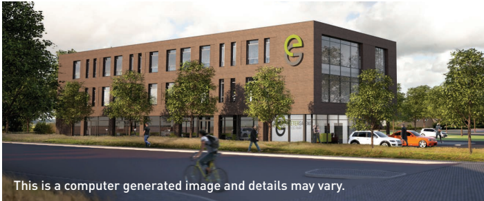
This is a computer generated image and details may vary.

The location has excellent road, air and rail links together with a sustainable transport strategy linking it to Exeter City Centre and the new community at Cranbrook.